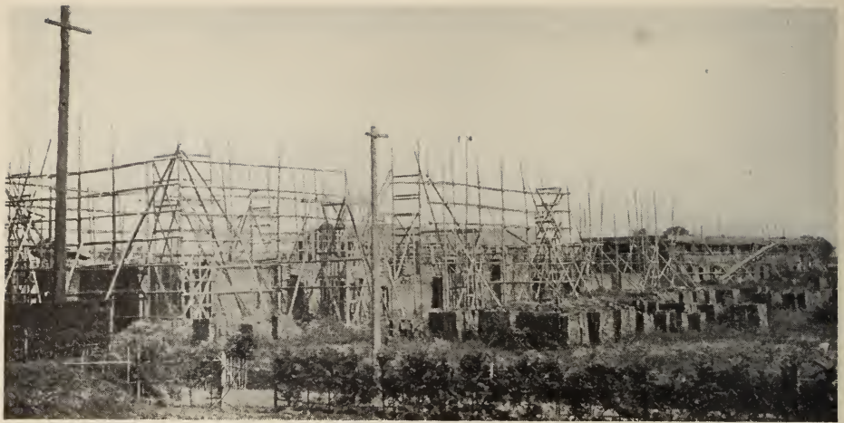
GENERAL VIEW OF NEW BUILDING, SAINT PAUL'S COLLEGE, AUGUST 1, 1917 Beginning from left to right: Chapel, Academic Building, West Dormitory

ond group, may without much difficulty be started. When these are all completed, we will see a splendid cluster of buildings really worthy to be the home of higher learning.